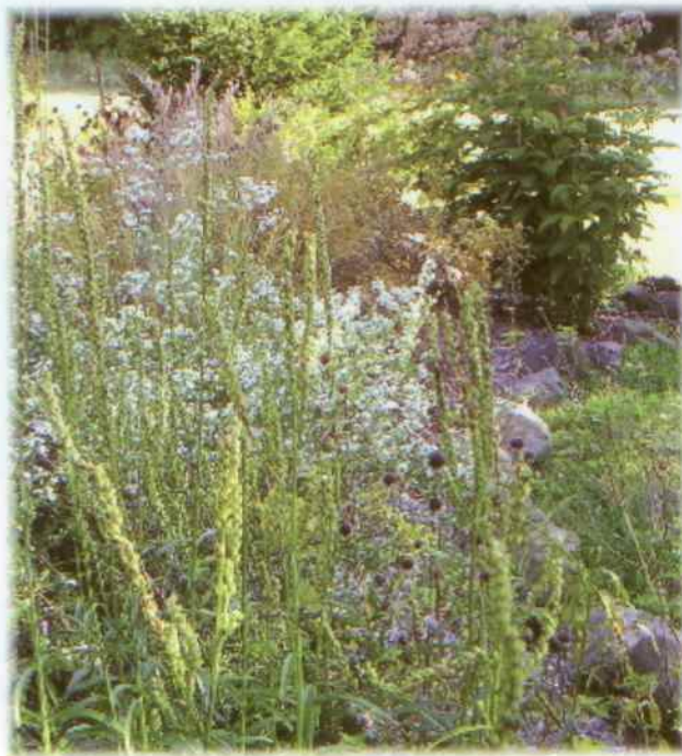
This rain garden features the following fall species: Wild Bergamot, Brown-eyed Susan, Aster, Beardtongue, and Obedient Plant.